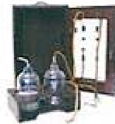
胸引引流系統 Chest Drainage System