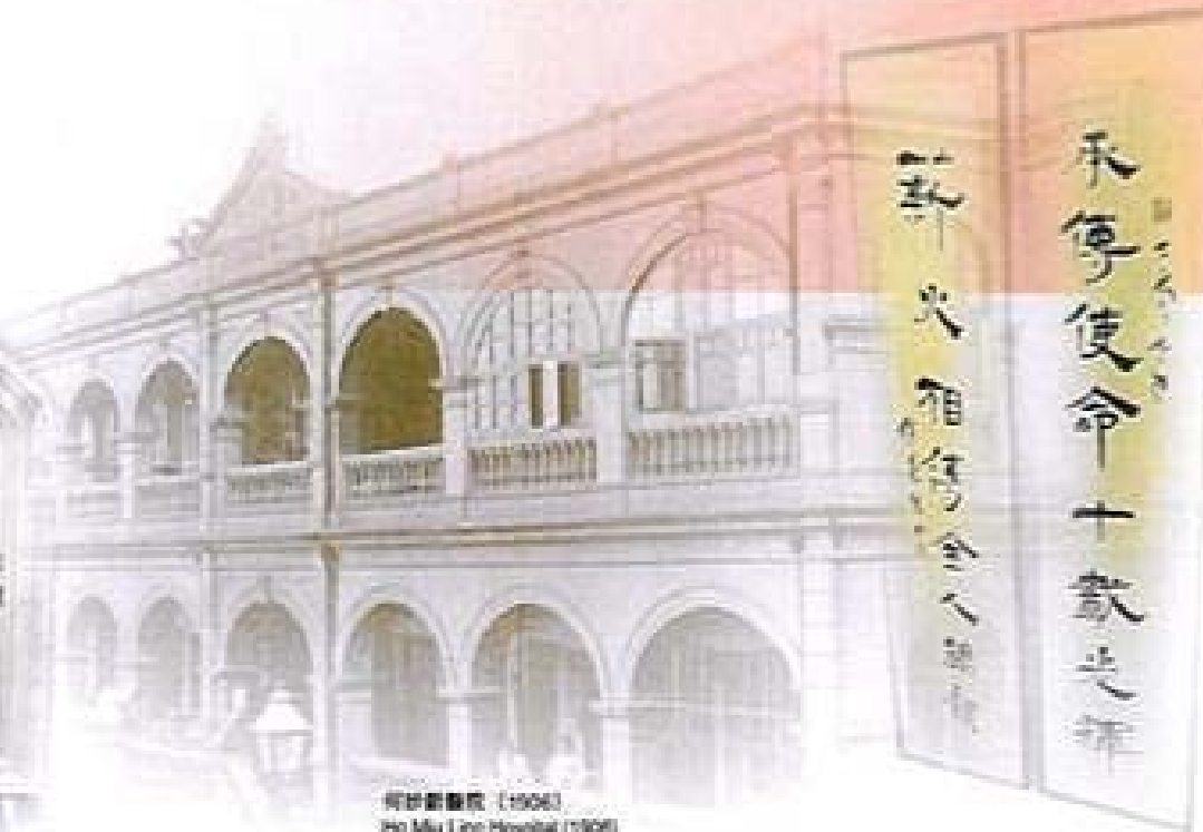
何啟新醫院 (1904) Ho Mu Ling Hospital (1904)