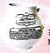
李氏莫氏吸入器 Maw's Inhaler