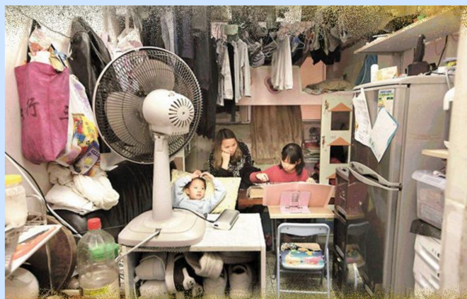
Fig 1. A Subdivided Unit in Hong Kong (Lai, Y.S., 2024)