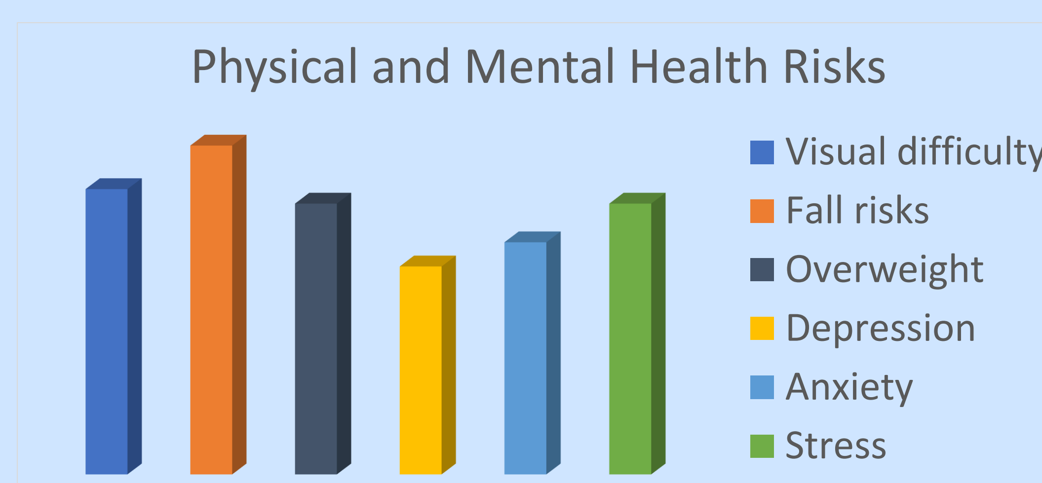
Fig 2. Physical and Mental Health Risks